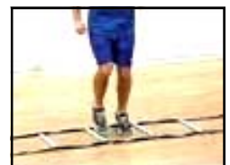
FRONT SHUFFLE THROUGH