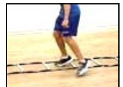
SIDE SHUFFLE THROUGH